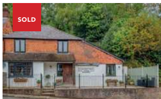
Fletching Street, Mayfield