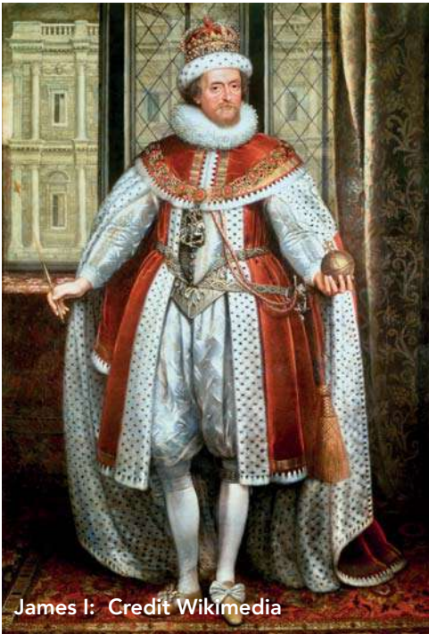
James I