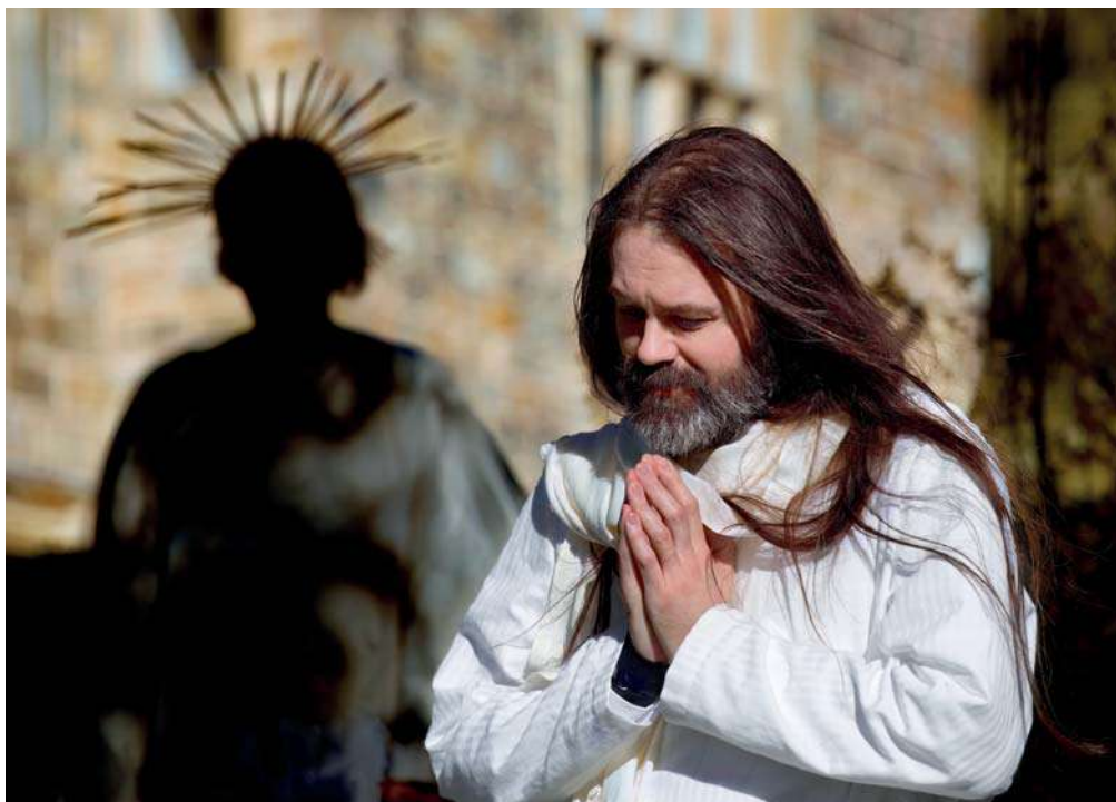
The Garden of Gethsemane - Jesus praying and his betrayal by Judas