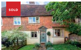
Fletching Street, Mayfield