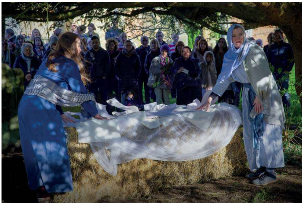
Above, the empty tomb and below, The Resurrection