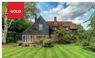
Tunbridge Wells Road, Mayfield