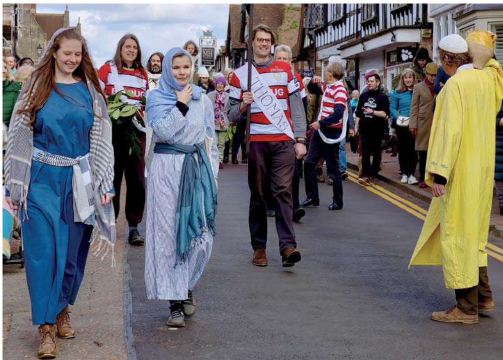
Above, the triumphal entry into Jerusalem, below, paying taxes to Caesar