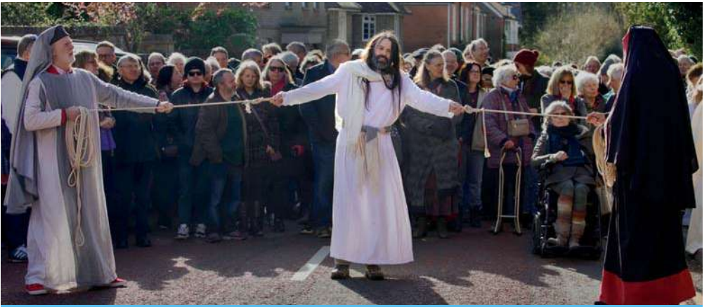
Jesus is arrested and tried