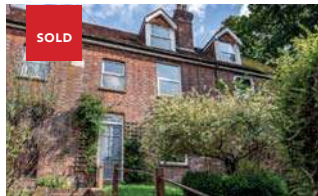
Love Lane, Mayfield