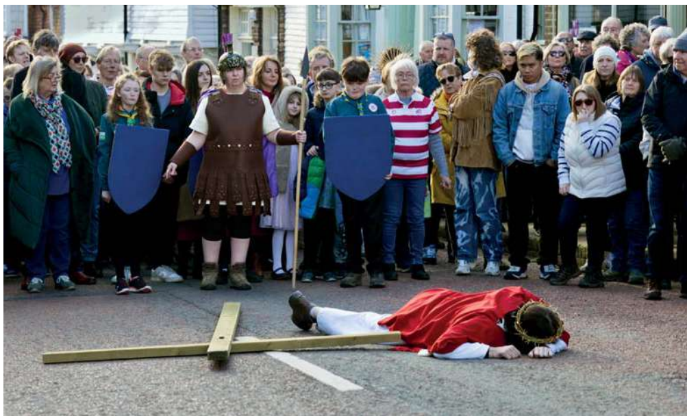
Above, Jesus collapses and below, The Crucifixion