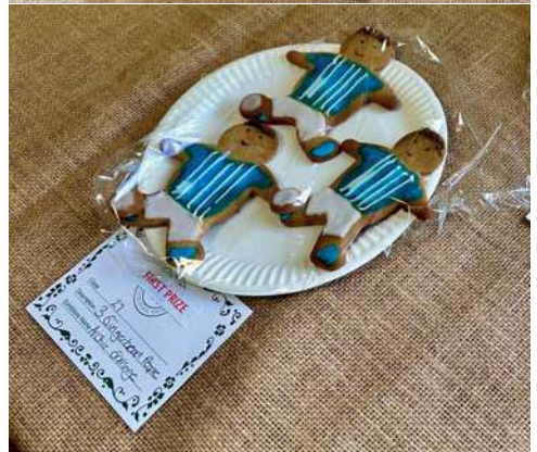
Some of the Winning Exhibits