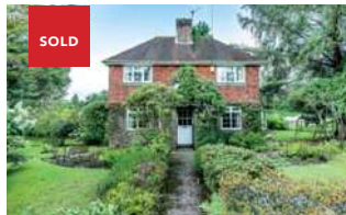
The Warren, Mayfield

If you are looking to sell your property, get in touch with your local estate agency team today.