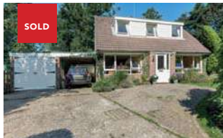
Salters Green, Mayfield