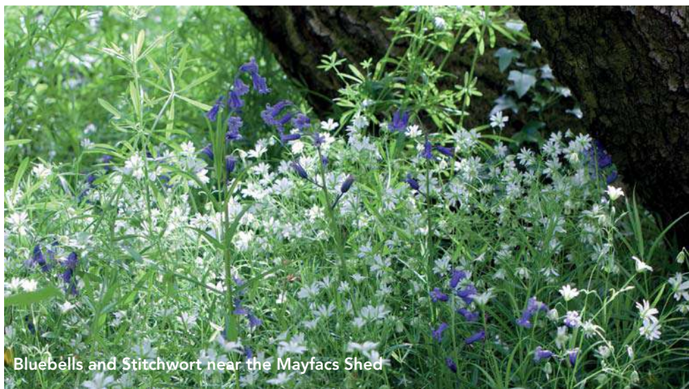
Bluebells and Stitchwort near the Mayfacs Shed